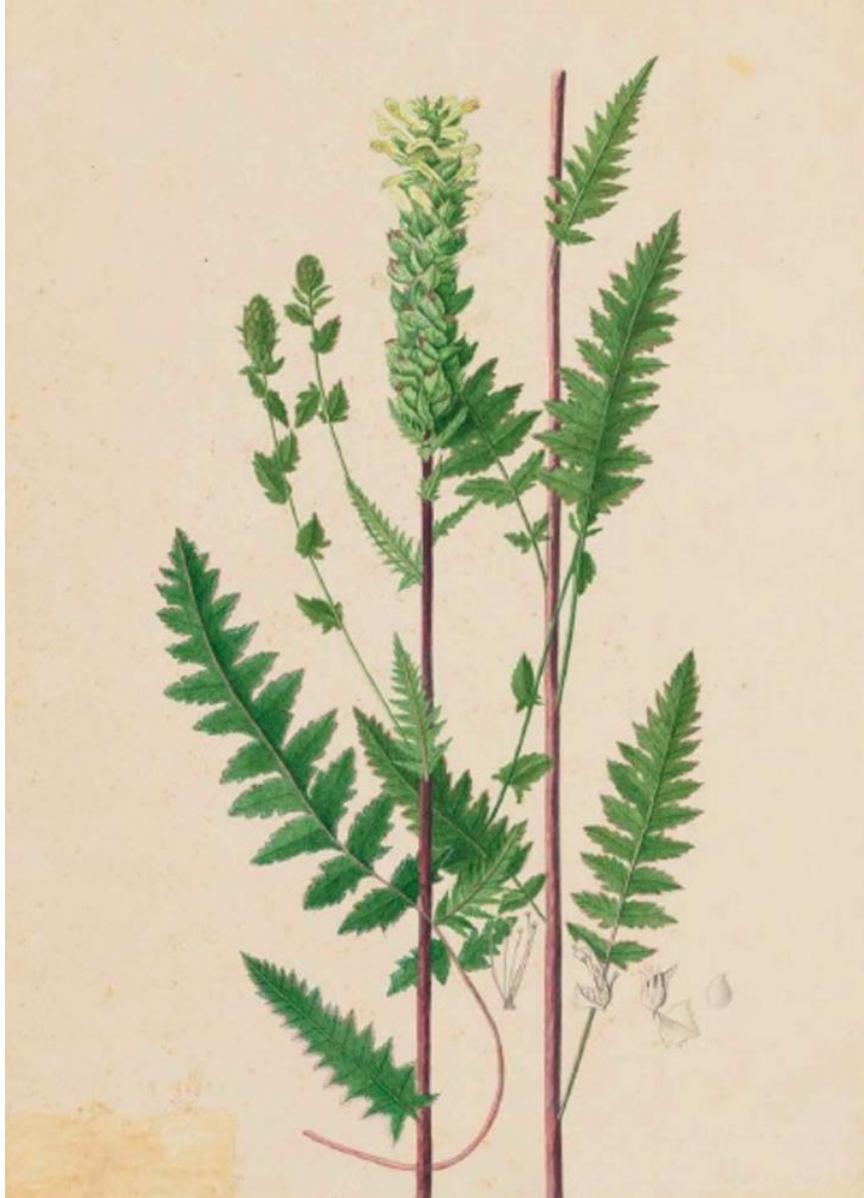
Painting by Kate Furbish from Plants and flowers of Maine: Kate Furbish's Watercolors, courtesy of Rowman & Littlefield

January 2019 Northeast Region (Region 5) Maine Field Office, East Orland, Maine